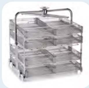
Rack 4 levels