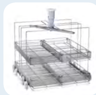
Rack 2 levels