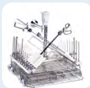
Rack for MIC instruments