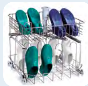
Rack for clogs