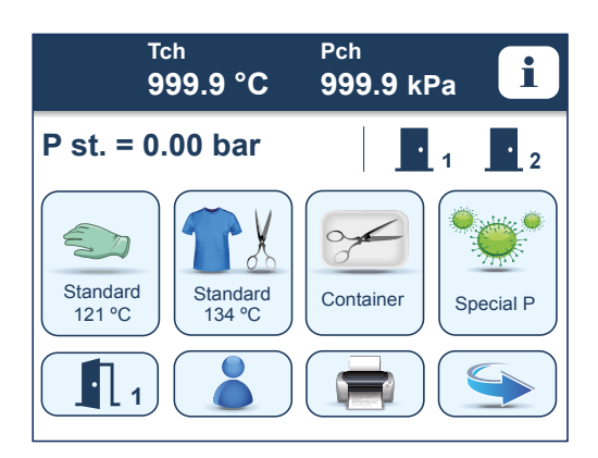
Program selection menu