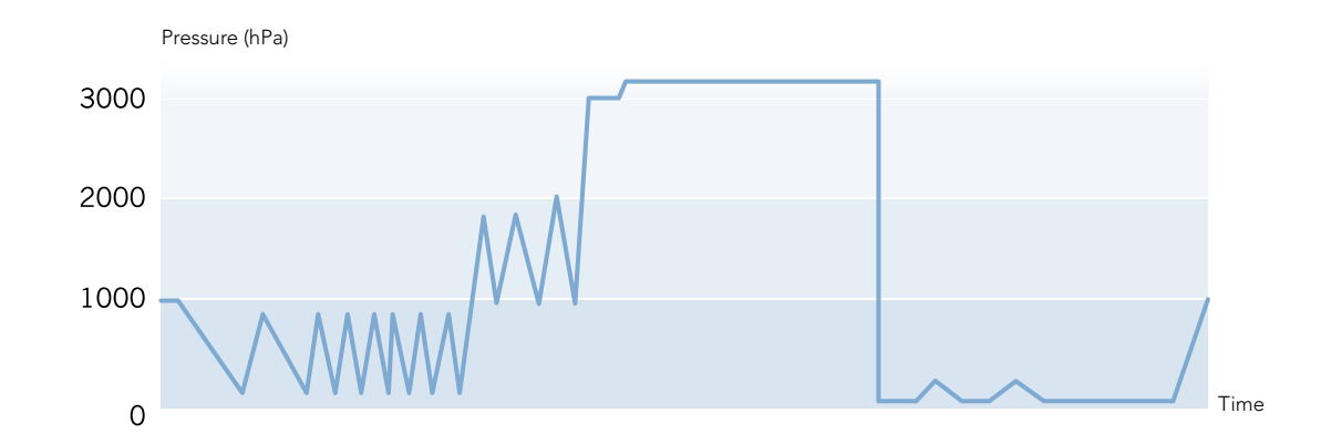
Chart (Pressure profile) of a production cycle: