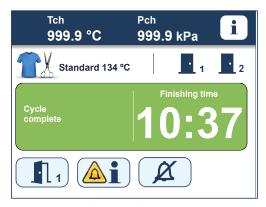
Cycle complete screen