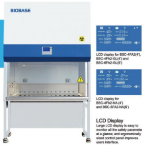
LCD display for BSC-4FA2-GL(4), BSC-4FA2-GL(4) and BSC-4FA2-GL(3)